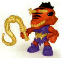
○ GOLD WHIP