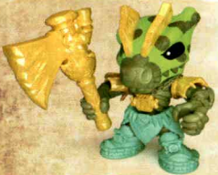
○ GOLD EDGE