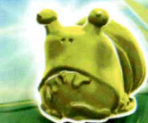
SNAIL OF STONE