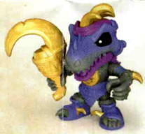
○ RAP RAIDER